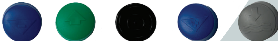
Different button options

Additional information only individual buttons are approved