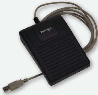
The 6210-0084 is a stock model