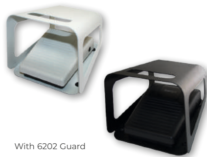
With 6202 Guard