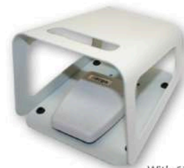
With 6202 Guard

Minimum delivered batch quantities - 100 pcs