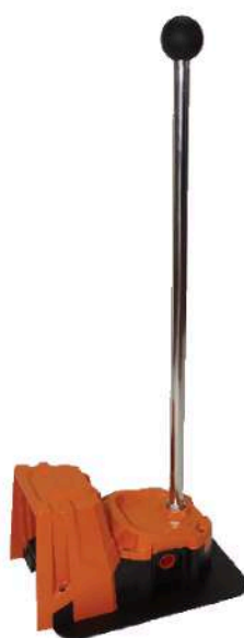
with 6050-5500-0154 Base Plate and Guard (order details see "Accessories")