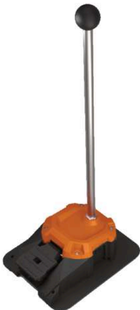
with 6050-5500-0154 Base Plate (order details see "Accessories")